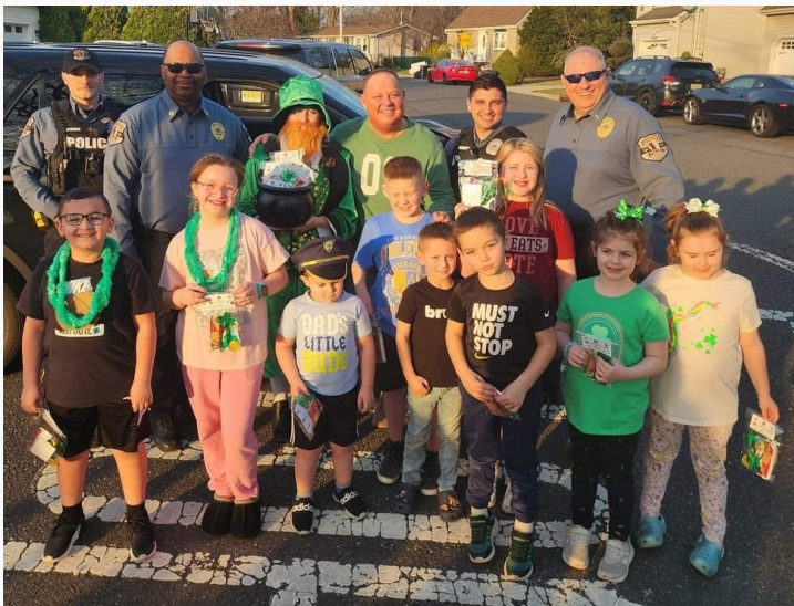
Lucky Leprechaun Leap