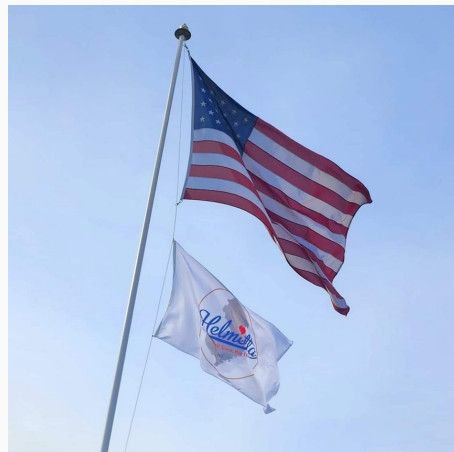
New Borough Flag