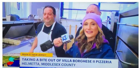
MAIN ST NEW JERSEY TAKING A BITE OUT OF VILLA BORGHESE II PIZZERIA HELMETTA, MIDDLESEX COUNTY