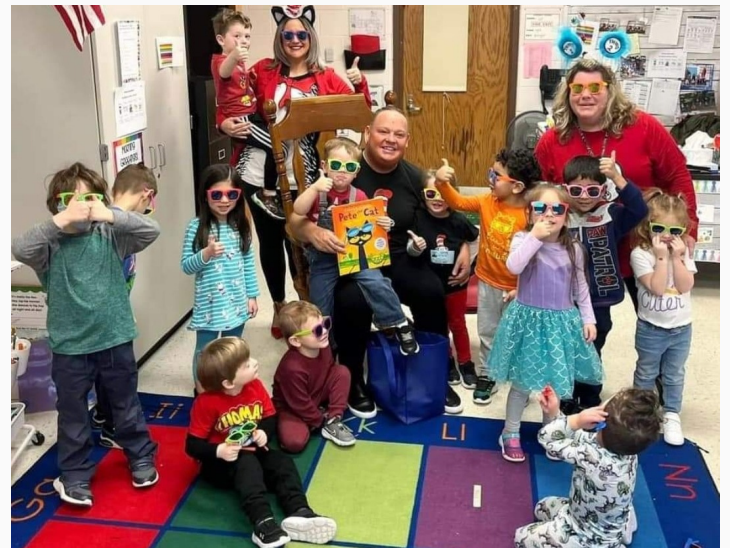
Read Across America