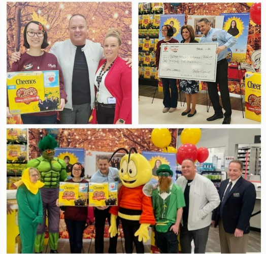
ShopRite Partners in Caring