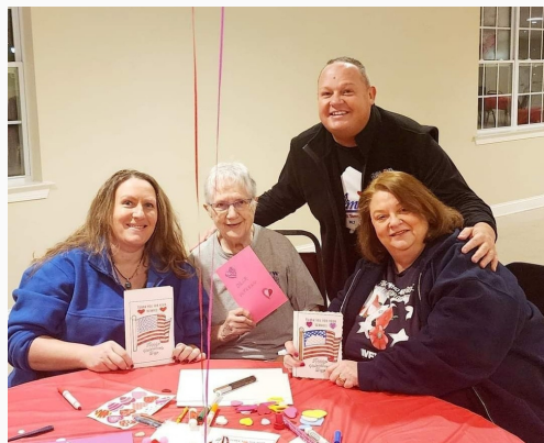
Service & Sweets