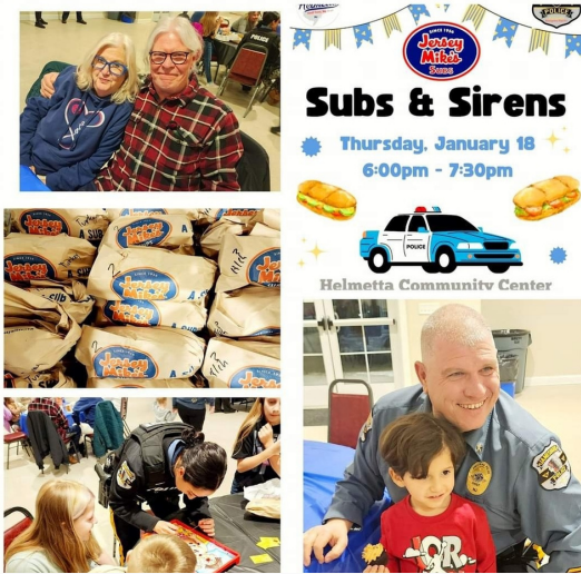
Subs & Sirens