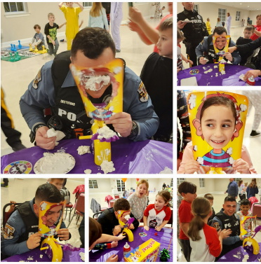
PJs & Pizza with the Police