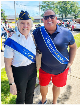
Memorial Day Parade