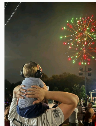
Spark in the Park