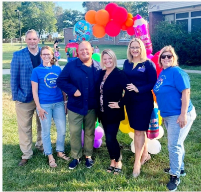
Mornings with the Mayors