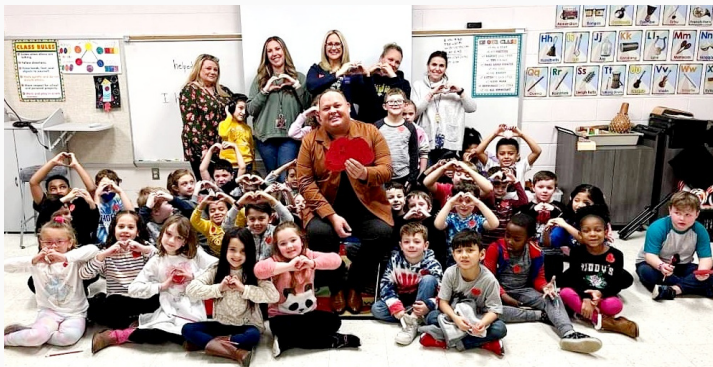
Small Town Big Heart at Schoenly School