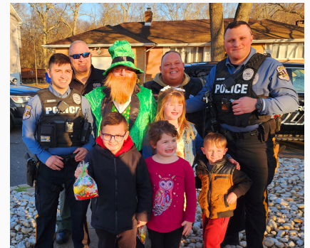
Lucky the Leprechaun