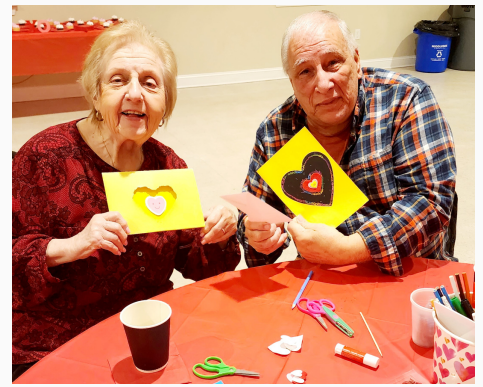
Service & Sweets for our Troops