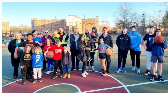
Dunk with the DPW