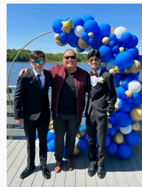
Picture Perfect for Prom