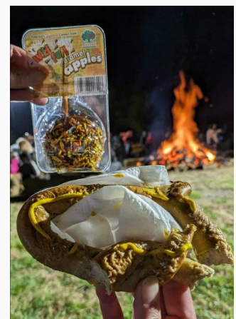
Hayrides & Bonfire