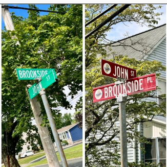
New Street Signs