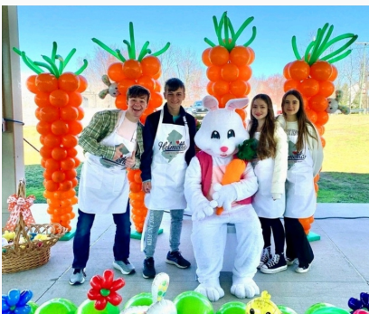
Easter Egg Roll