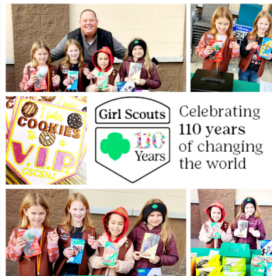
Girl Scouts Cookies VIP