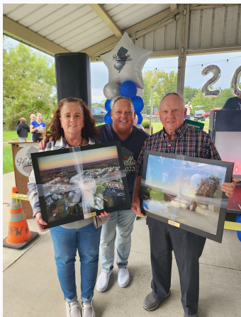
Helmetta Hometown Heroes