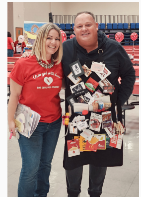
Project Senior Week