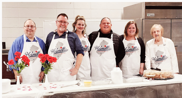
Serving Family Meals at St. George's Church