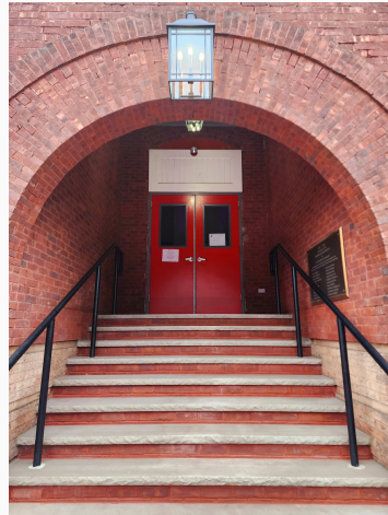
New Borough Hall Front Steps