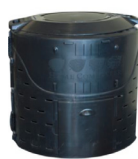
Home Composter 30" high x 32" base 17 cu. ft/125 gal