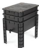
Vermicomposter indoor use

Call Solid Waste Management at 732-745-4170 for more information.